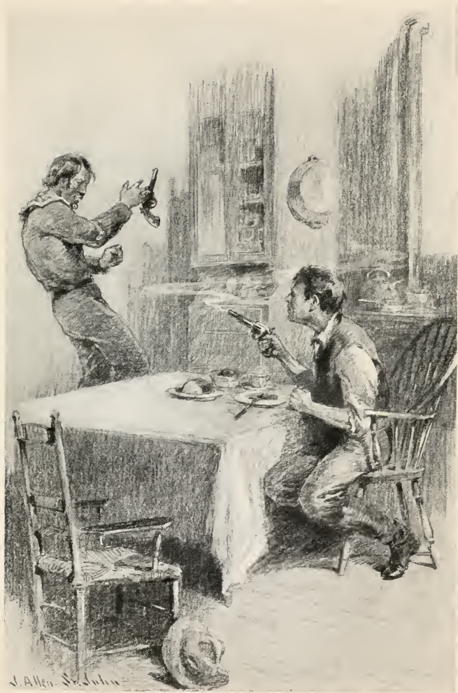
Jim fired, and the fellow's revolver went clattering to the floor